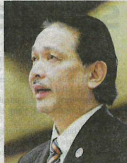
DR NOOR HISHAM

Beliau turut memaklumkan, tiada kes kematian akibat pandemik itu dilaporkan sejak 12